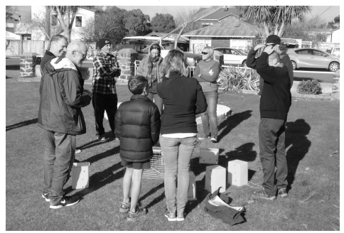
Amateur trappers in training

Check out the Beyond Orokonui website for more information - www.beyondorokonui.org.nz