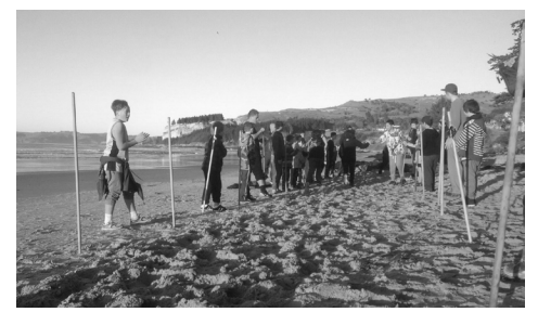
Early morning training on Karitane beach

http://ngaitahu.iwi.nz/whanau/aoraki-bound Please send your expression of interest to Justine at the Runaka Office by the end of September at the lastest.