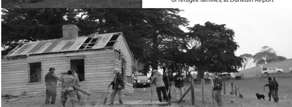
Te Awa Koiea (Brinn's Point) - Roiti whanau/friends erecting fence last Spring and now working on restoration of whare